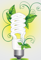
HIGH IMPACT EFFICIENCY MEASURES