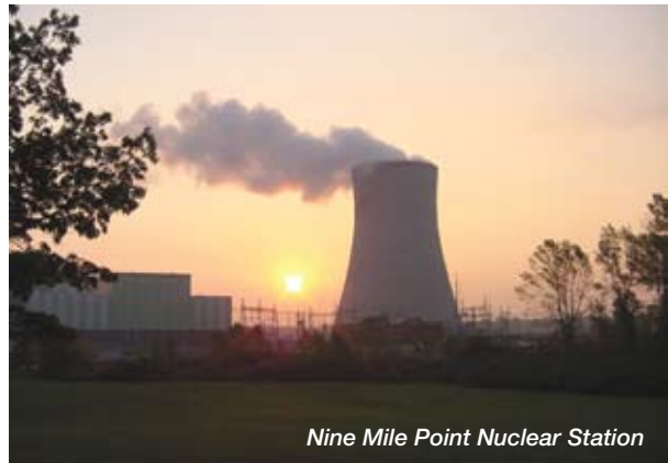
Nine Mile Point Nuclear Station

Nine Mile Point Nuclear Station is located north of Syracuse in Scriba, New York, and has two boiling water reactors. Unit 1 is a 620 megawatts reactor that entered service in 1970, and Unit 2 is a 1,138 megawatts reactor that began operation in 1988. As part of the company's balanced growth trend, Constellation Energy purchased Nine Mile Point in 2001 from Niagara Mohawk Power Corporation and other utilities. Constellation Energy now owns 100 percent of Unit 1 and 82 percent of Unit 2—1,553 megawatts of Nine Mile Point's 1,758 MW of total generating capacity. The Long Island Power Authority owns 18 percent of Unit 2.